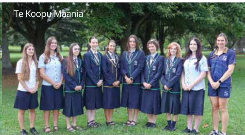
Te Koopu Maania